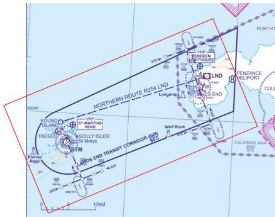
Figure 2 Proposed LETC airspace with increased size applied

AIRAC AD 2-EGHC-3-1 Land's End Transit Corridor